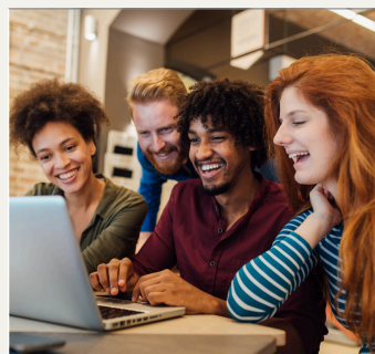
Free back to school protection!