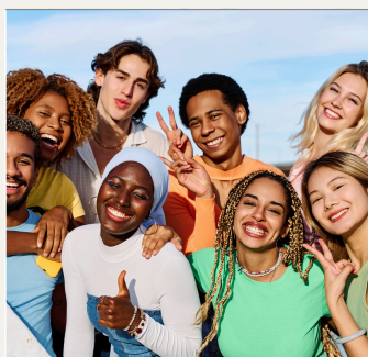
Which one of us has an HPV infection?