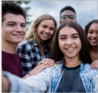
Four of us will contract HPV in our lifetimes.