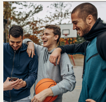
We're at risk for HPV-related cancers too.