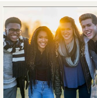
The HPV vaccine protects ALL of us!

You can get the vaccine for free in Alberta if you are 26 or younger.